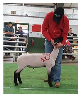
Champ Wether Sire Wampler Suffolks