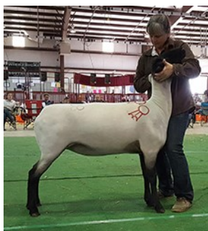
Champion Suffolk Ewe MacCauley Suffolks