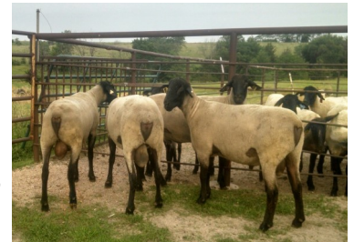
Range rams that went to Wyoming in 2015