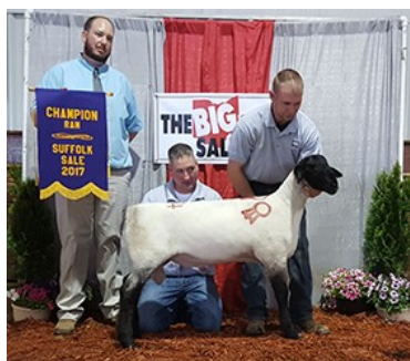
Champion Suffolk Ram Mil-Sid Farm