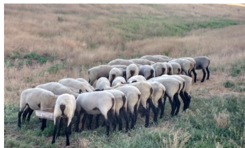
2017 replacements halfway through parasite resistance trial