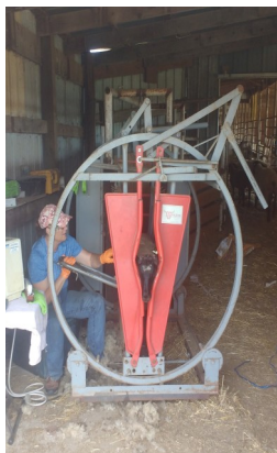
Scan day for carcass traits

what do you do to promote the association and registered Suffolk sheep? Within all species, the breeds that have something to offer their industry at a particular point in time coupled with a breed organization capable of capitalizing on that, will grow. Look no further than Katahdins, Dorpers or Boer goats.