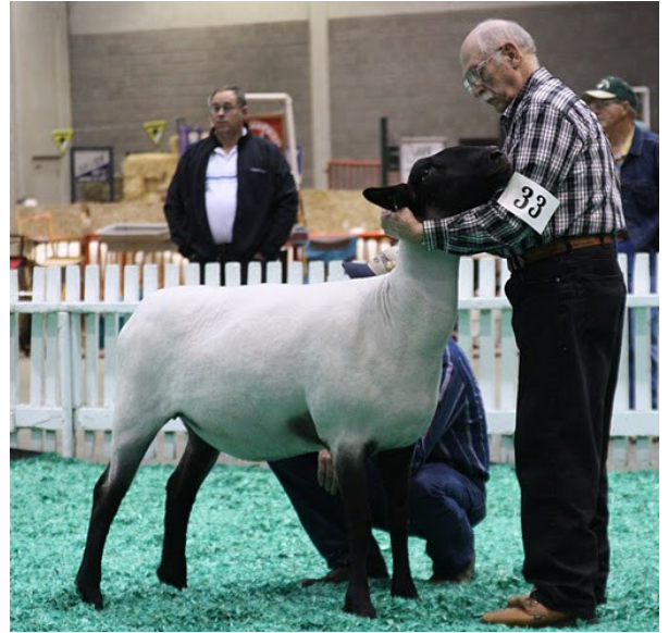
Grand Champion Suffolk Ewe - RennVue Farms NV2948 - RennVue Farms