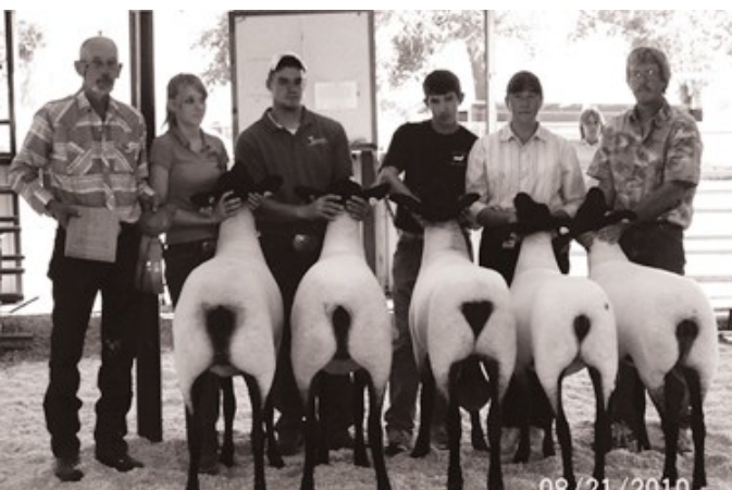
2010 Grand Champion Flock & Supreme Champion Flock at Wyoming State Fair.